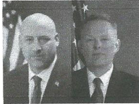
(Photo: Photo illustration, images courtesy of U.S. Attorney's office and FBI)

Meet the new guys responsible for preventing terrorism, protecting civil rights and rooting out public corruption in New Jersey.